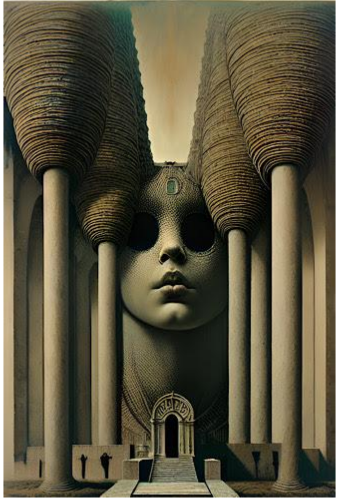
“Philosophy” giclee print on paper, 16”x16”

My creative process varies. Many times, I start with an idea and work digitally, building in two or three dimensions. Sometimes I start with found objects and work with them.