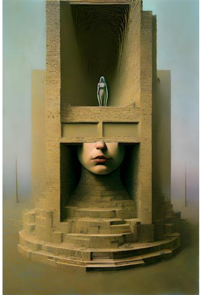
“Merrily We Roll Around” giclee print on paper, 16” x 16”

As we are pulled towards conformity and anonymity, I wonder how we can preserve our individualism and humanity.