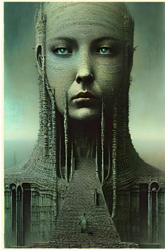
“Adoration” mixed media on canvas, 16”x20”