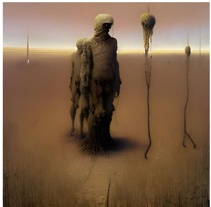
“Land” giclee print on paper, 16” x 16”

Like Hopper, I find it difficult to explain my work, because it does not come necessarily from a logical place. It emerges from a maelstrom of concerns, fascinations and experiences.